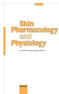
推薦：臨藥所 IF: 2.885