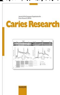
推薦：口醫所 IF: 2.676