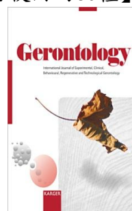
推薦：老年所 IF: 2.676