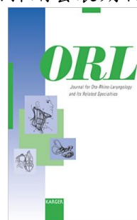
推薦：耳鼻喉部 IF: 1.099