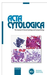
推薦：病理部 IF: 2.514